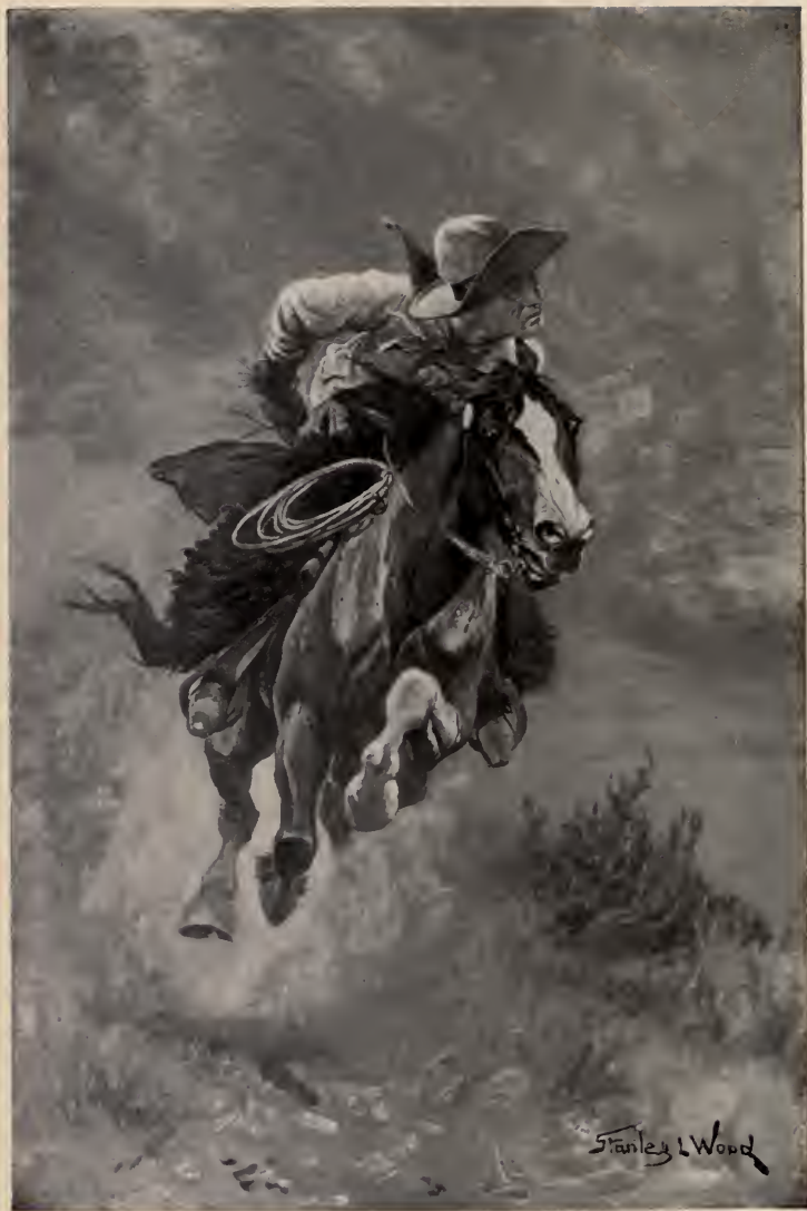
As he raced over the uneven prairie he fumbled with the saddle string. FRONTISPIECE See Page 83.